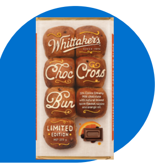
Whittakers has unveiled a limitededition Choc Cross Bun flavour combining the aromatic essence of the spiced bun with chocolate. (NZ)