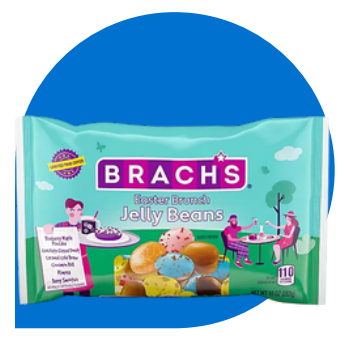
Brach's brunch-inspired Easter jelly beans come in six flavours including maple pancake, mimosa, caramel cold brew & berry smoothie. (US)