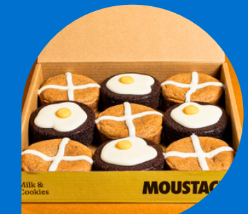
Moustache Easter Cookie Pie Pack featured Caramilk Hot Cross Bun & Creme Egg Cookie Pies. (NZ)