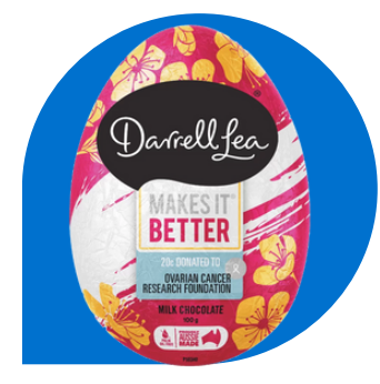
Darrel Lea has partnered with Ovarian Cancer Research Foundation to launch a Milk Chocolate Egg made from sustainably sourced cocoa. (AU)